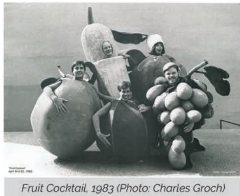
Fruit Cocktail, 1983

In 1980, a group of lesbian and gay activists founded the Gay Community Appeal, raising funds for community projects and organizations. Soon after, the name changed to the Lesbian and Gay Community Appeal, or LGCA.