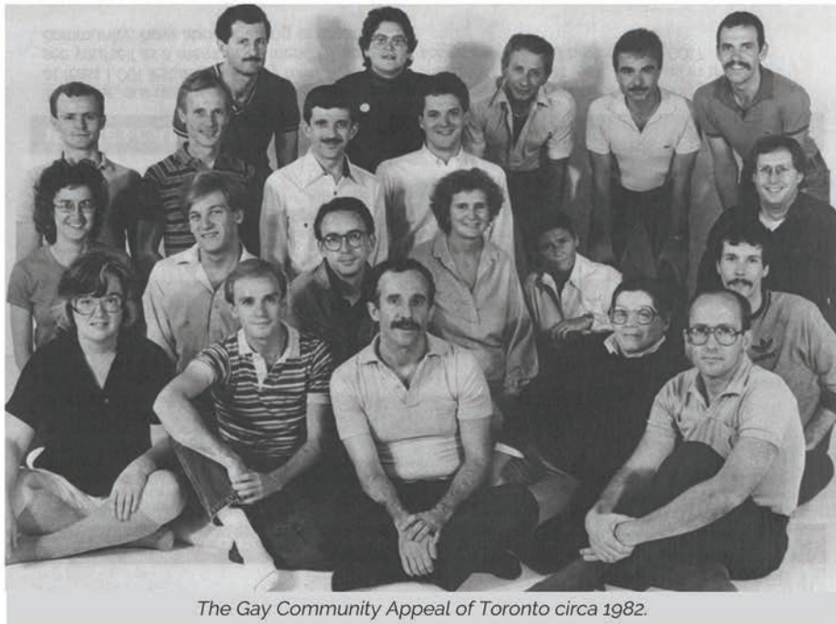
The Gay Community Appeal of Toronto circa 1982.

In 1980, a group of lesbian and gay activists founded the Gay Community Appeal, raising funds for community projects and organizations. Soon after, the name changed to the Lesbian and Gay Community Appeal, or LGCA.